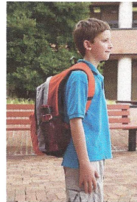
CORRECT Load no more than 10-15% of body weight