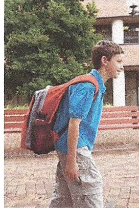
WRONG Load too heavy