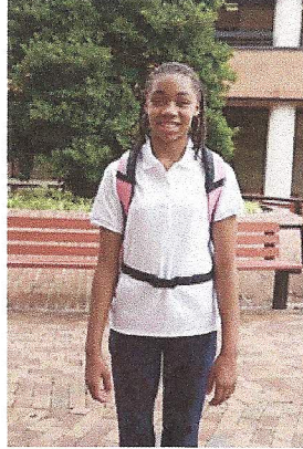
CORRECT Wide, padded straps on both shoulders